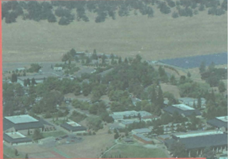
Ariel view of Butte College, a model for its community. Following Butte’s lead, the local school district is also planning to build green schools.

“We have a one megawatt plant now and we want to